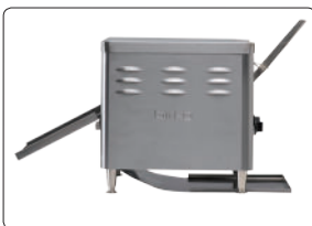
Toaster opening sizes : 260mm x 60mm