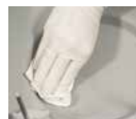
Always perfect chamber cleaning