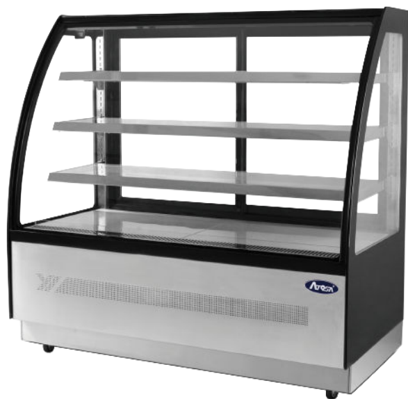
Four Tier Upright Curve Cake Showcase