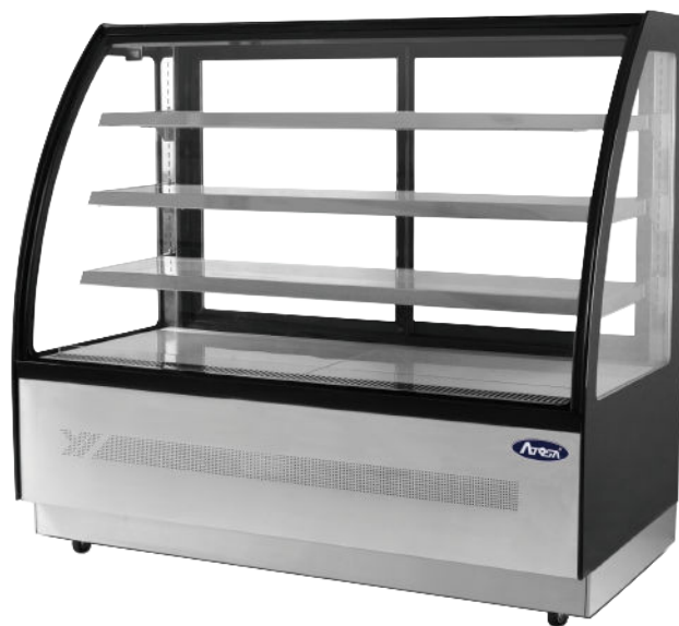
Four Tier Upright Curve Cake Showcase