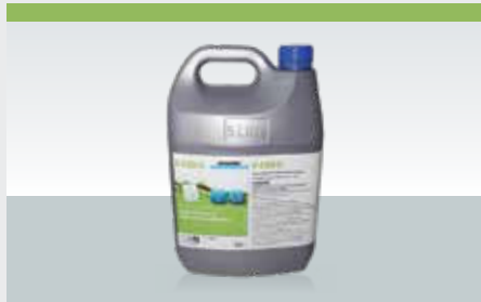
Glass washing detergent F420e

Liquid, alkaline detergent with active chlorine; ideal for removing coffee and tea stains.