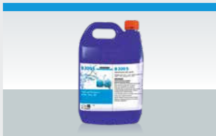
Glass washing rinse aid B200S

Liquid, alkaline, active chlorine detergent.