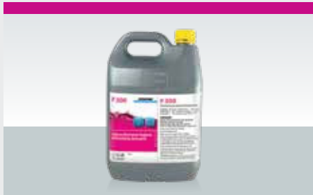
Universal detergent F300

Highly effective and economical detergents and rinse aids that precisely adapt to various applications for cleanliness and hygiene of the highest standard.