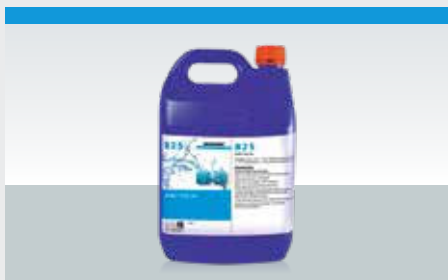
Universal rinse aid B2S

Highly concentrated, neutral rinse aid that guarantees the best possible drying results for reusable plastic cups for germ free stacking.