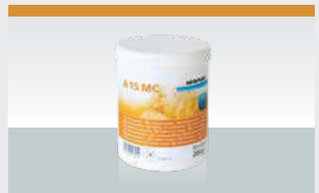
Cleaning tablets A15MC

Make sure you have spare pre-filters on hand. Charcoal pre-filter for Excellence i and AT reverse osmosis.